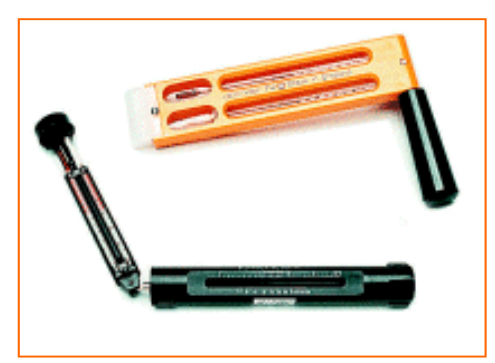
Elcometer 116 Whirling & Sling Hygrometer